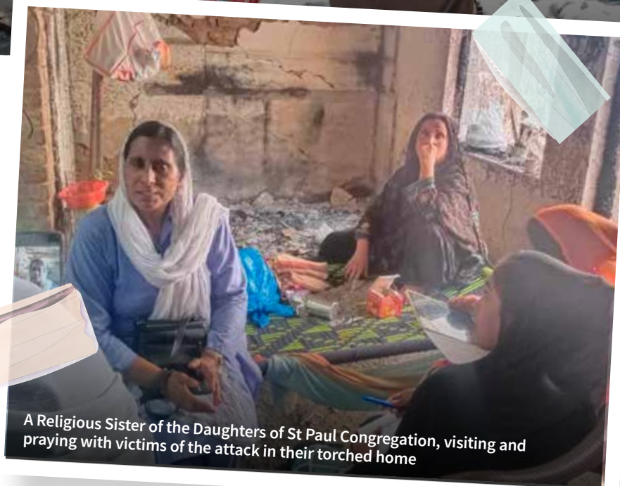
A Religious Sister of the Daughters of St Paul Congregation, visiting and praying with victims of the attack in their torched home

Your support can provide them with the essentials they need to survive and give them the chance and also the hopes and strength to rebuild. 🙏